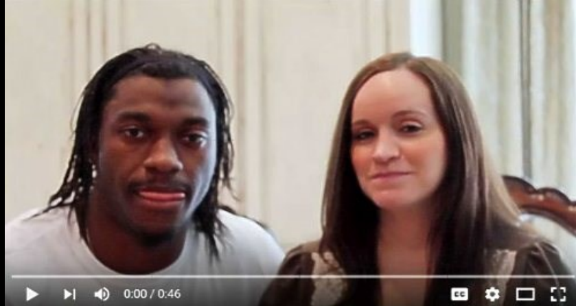
A VERY SPECIAL VIDEO MESSAGE FROM MR. ROBERT GRIFFIN III, TO DC'S TOP GRADUATES.